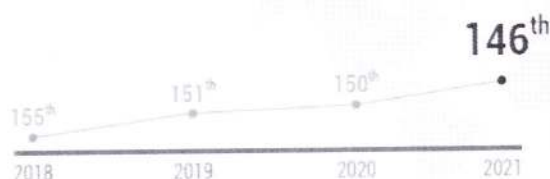
2021 QS Global University Ranking