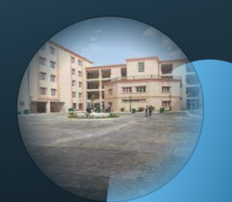
4. Faculty of Letters and Languages.

2. Faculty of Nature and Earth Sciences.